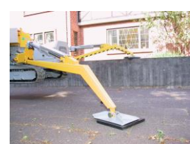
Easy set up