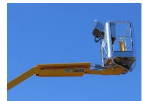
Fly jib (option)