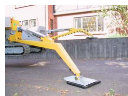
Easy set up