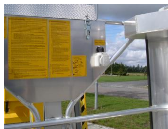
230 V outlet in basket